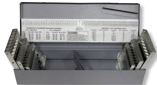
115-piece Case Number 57810