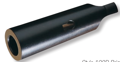
Style 100D Bright